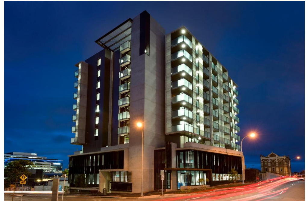
5 Green Square Close – supplied by Brisbane Housing Company

Outcome: A Liveability Framework for Medium to High Density Urban Housing