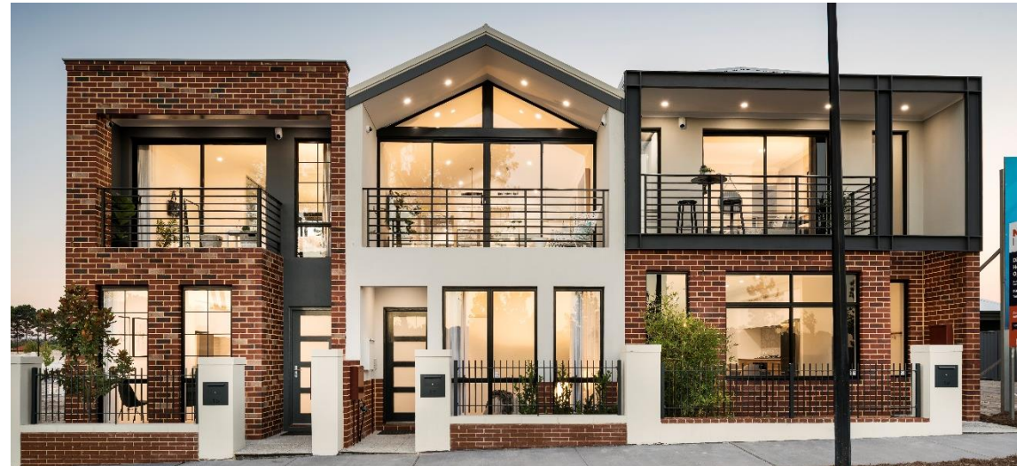
Drummond, Ellenbrook