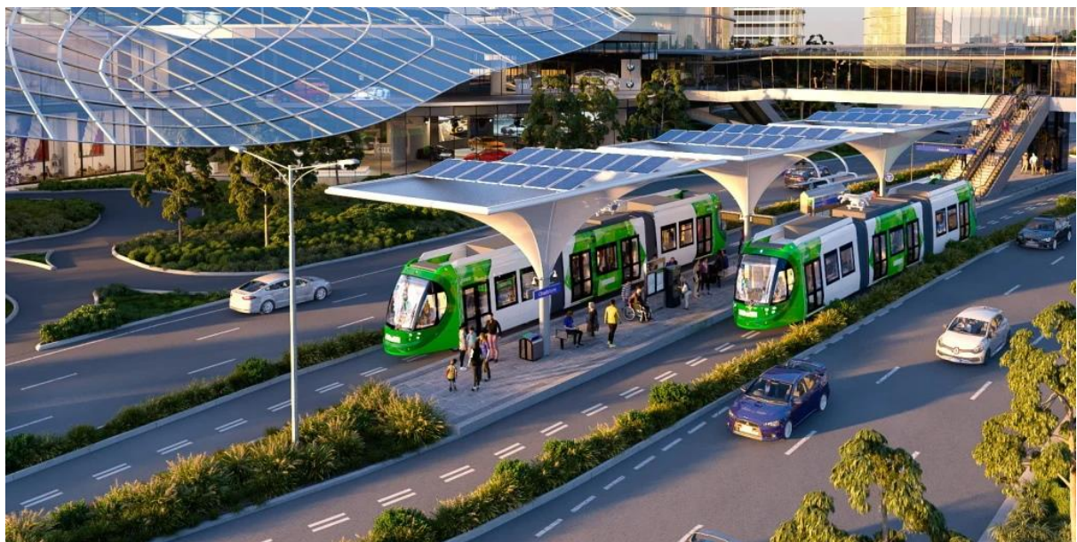
Figure 1. A Trackless Tram and a Green TOD that is net zero.

Thomson and Newman (2018) argue that urban fabrics (walking, transit, and automobile) and their associated infrastructure, exhibit different opportunities in generating sustainable development outcomes, with the automobile fabric being the least conducive. Mid-tier transit provides the opportunity of creating transit urban fabric and walking urban fabric through automobile fabric. Thus a mid-tier transit system and its accompanying operational features can have a significant impact on the ability of cities to provide regenerative outcomes (Arrington and Cervero, 2008) due to its construction around transit corridors accompanied by high-density regenerative development (Huang and Wey, 2019; Newman, 2017; Newton et al., 2022). These high-density developments are what Huang and Wey (2019) refer to as Green TOD, an expansion of the traditional TOD paradigm towards greater consideration of ecological and environmental dimensions (as illustrated in Figure 1).