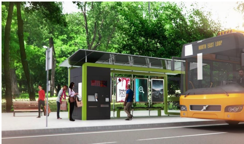
Figure 2. AQUIS Innovo Smart bus stop concept art

demonstration of a smart stop was revealed by Hungarian smart technology company AQUIS Innovo (See Figure 2 ). The smart stop includes a range of innovative features such as ticket vending, passenger counting, interactive transport information, Wi-Fi, USB recharging, weather forecasting, digital advertising, and taxi ordering capabilities. Additionally, the stop can integrate with local micro-mobility elements by providing an E-bike rental and recharging station. Accompanying each station is a surveillance camera to provide riders with improved perceptions of safety (Iseki and Taylor, 2010; Nápoles et al., 2020). AQUIS Innovo (2016) states that the stop is modular in design allowing for implementation to be relatively quick. This may suggest a potential opportunity to investigate smart stop integration with any mid-tier transit system such as those in modular trackless tram stations (Newman, Hargroves et al, 2021).