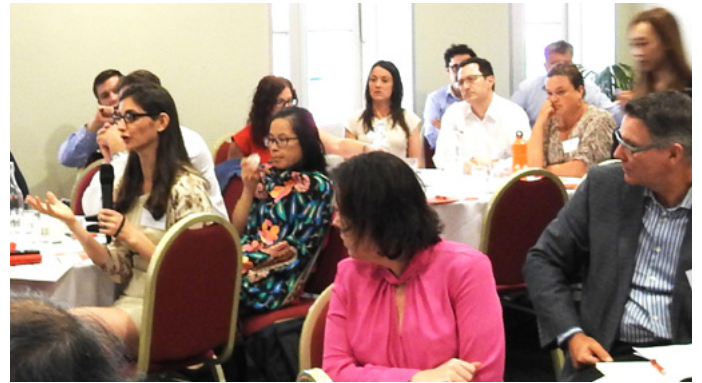
Audience participation in a question-and-answer session.