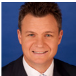
The Hon. Matt Thistlethwaite MP Shadow Assistant Minister for Treasury