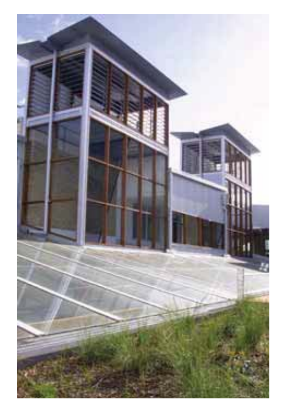
Figure 1: Thermal Chimneys<sup>26</sup>