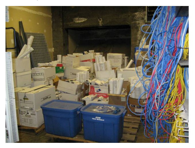
Building Construction Hand-over Project Information

Traditional facility management information specified in building construction contracts was created at the end of the construction process. It was delivered to the facility operator prior to the fiscal completion of the project, as shown below.