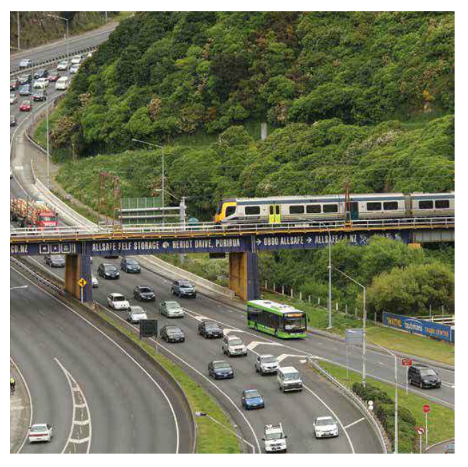
Construction to Operations for Network information exchange

In line with the small but significant change, is the proposed CONie ( Construction to Operations for Networks information exchange ). It will provide contractible methods, mandating the use of a connected digital repository (such as an SQL database) constructed to a standard specification, and suitable for automated input into redesigned compatible operations management systems.