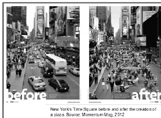
Figure 3: The reclamation of space in New York's Times Square