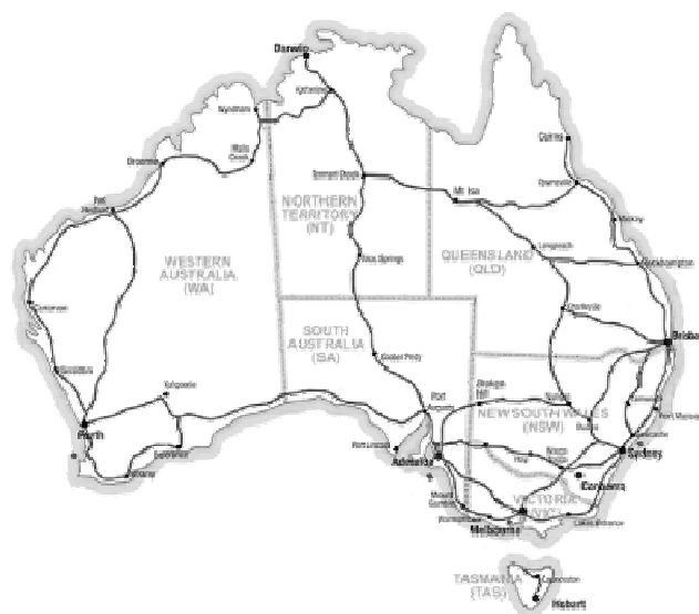
Figure 1: Major Australian road networks

Long-term planning and resilience-building is urgently required in response to emerging issues related to environmental impacts, carbon legislation, economic risks and social demands, to provide reliable and effective road networks into the future. Particularly relevant in Australia, where 814,000 kilometres of road network spans a wide range of geographic areas (see Figure 1), the cost of road construction in Australia is estimated to be in the order of $17.5 billion per year (Bureau of Infrastructure, Transport and Regional Economics, 2009). The road maintenance cost is estimated to be in the order of $5 billion per year and rising. This rising maintenance task, in which the cost is estimated to be in the order of $5 billion per year and rising (BIS Shrapnel, n.d.), was made clear by the forensic work of BIS Shrapnel in 2012 who revealed that for every $100 of net assets in Australia, we are only spending $1.44 on maintenance (Hart, 2012), which has resulted in years of under spending in maintenance on roads, public rail.