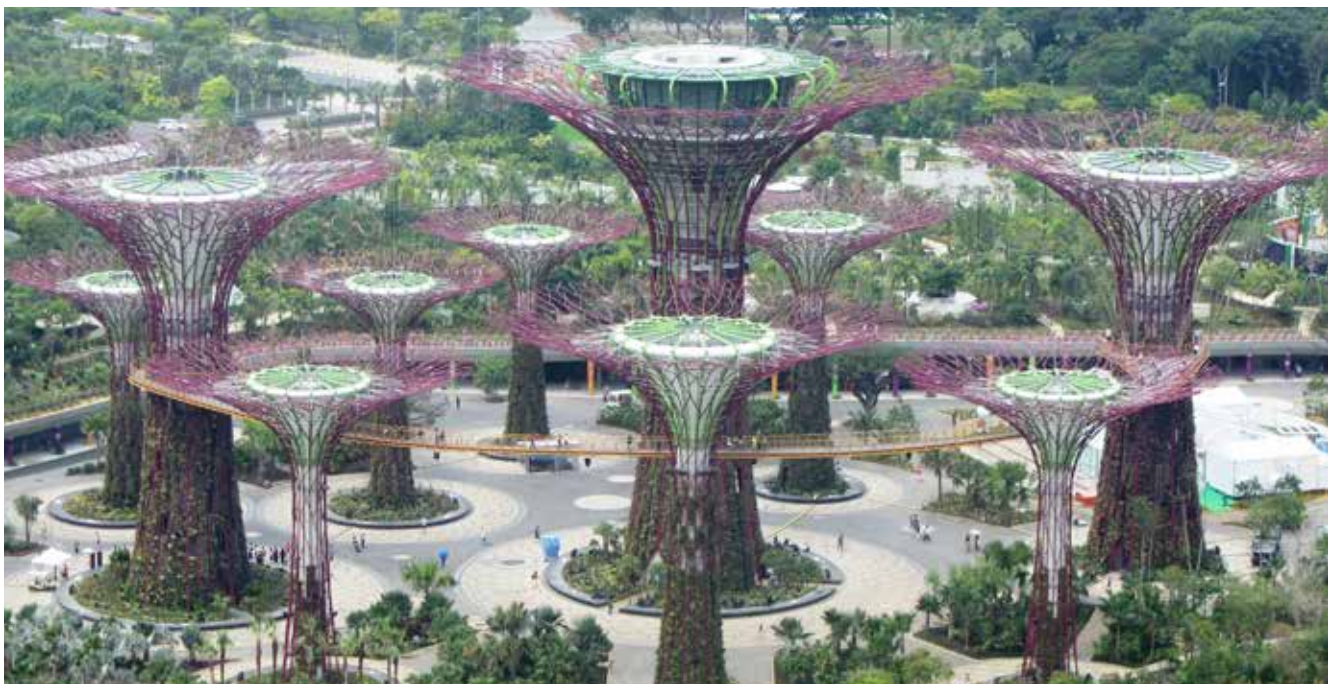
Gardens by the Bay is a 101-hectare site that brings people, nature and technology together. This is the Supertree Grove – the metallic structures are covered in plants and epiphytes, and you can climb the stairs inside for a view of the area.