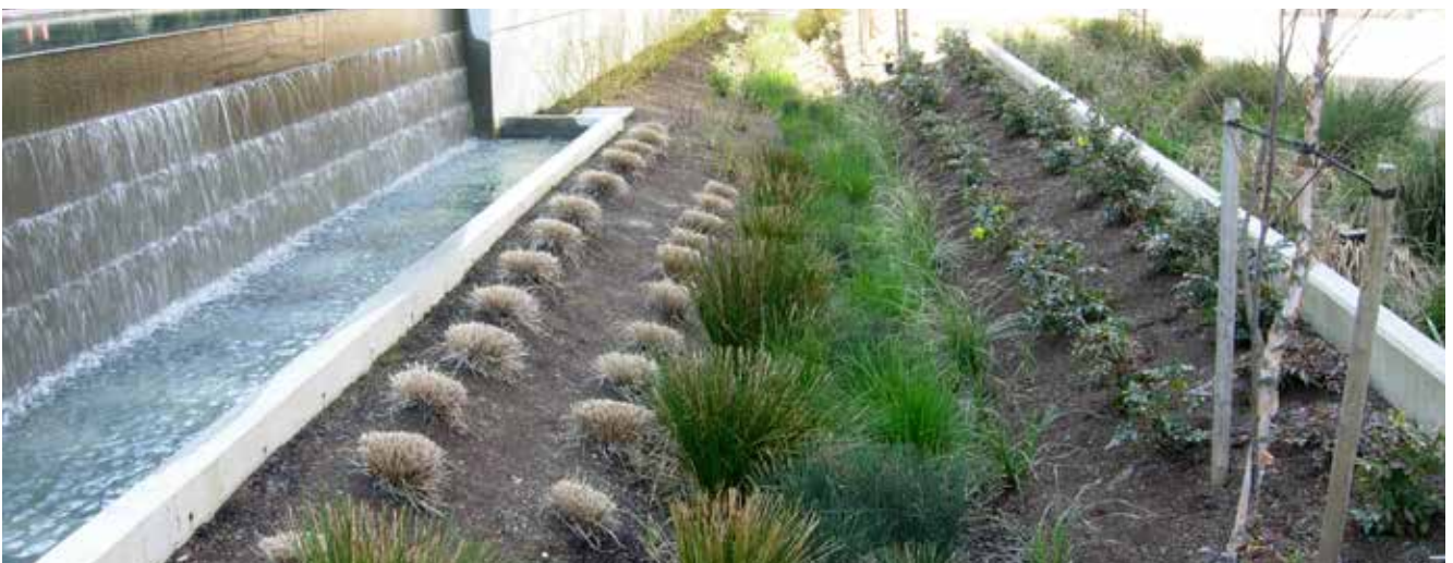
Green streets used throughout Portland incorporate vegetated infiltration trenches, which add visual amenity while also capturing, cleaning and infiltrating storm water. Image: Lisa Town, 2009.