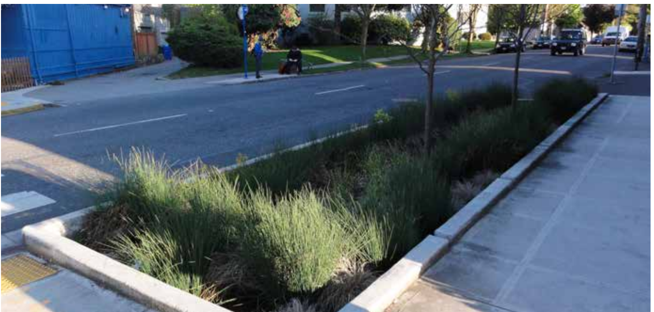
Infiltration gardens reduce storm water runoff throughout Portland, reducing the need for more costly grey infrastructure.

The City of Portland has a number of procurement requirements related to government owned buildings and government run programs. For instance, the 'Green Building Policy' requires all city-owned buildings to install a green roof, and provides incentives for private building owners to do so. The city's 'Stormwater Management Manual' requires that new developments and redevelopments with over 500ft 2 of impervious surface manage stormwater onsite through replicating as much as possible the pre-development hydrological conditions. 109 The Green Streets Policy stipulates that green street facilities be incorporated into all City of Portland funded development, redevelopment or enhancement projects, while the '1% for Green' fund requires qualifying city-funded development, redevelopment or enhancement projects to invest 1 per cent of the project's construction costs in green measures. Finally, the Green Street Resolution requires that either green street facilities be incorporated into public and private developments, or an off-site stormwater management fee be paid. 110