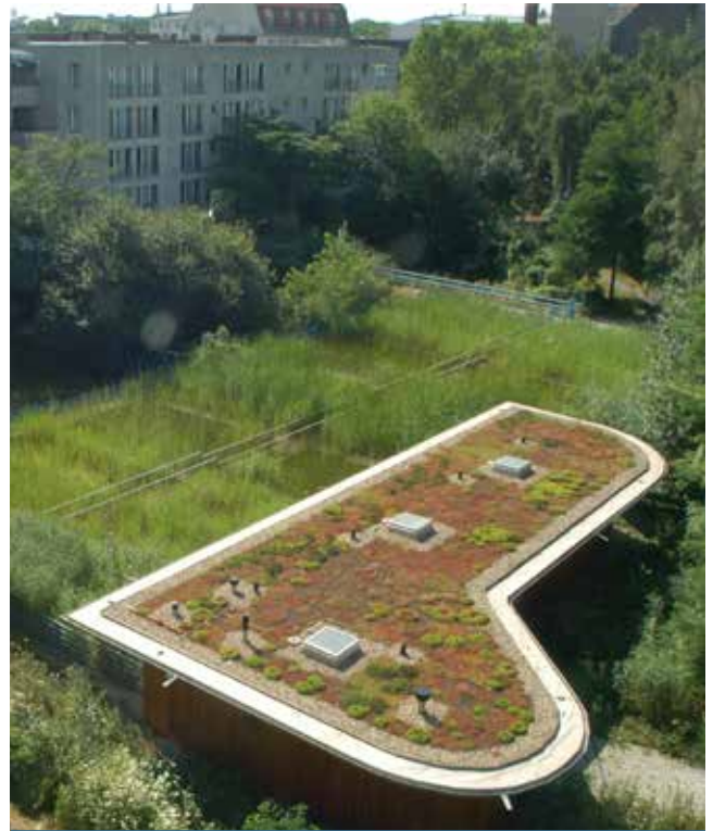
A green roof in Berlin's Potsdamer Platz, where a range of biophilic elements are used to capture, filter and beneficially use rainwater.

For its literature review the project has categorised biophilic urbanism into three scales, namely, the building, neighbourhood, and city scales, as summarised in Table 1. Particular biophilic design elements can provide different benefits at different scales. For example at the building scale, green roofs and green walls reduce energy demand and improve water management, while at higher scales biophilic elements help to alleviate the urban heat island effect and improve air quality and the