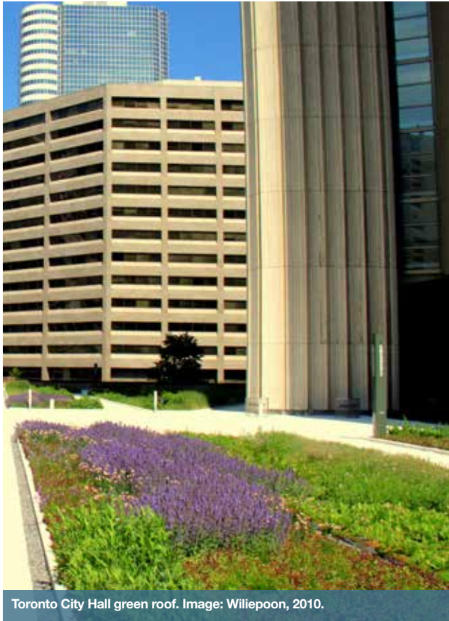
Toronto City Hall green roof. Image: Wiliepoon, 2010.