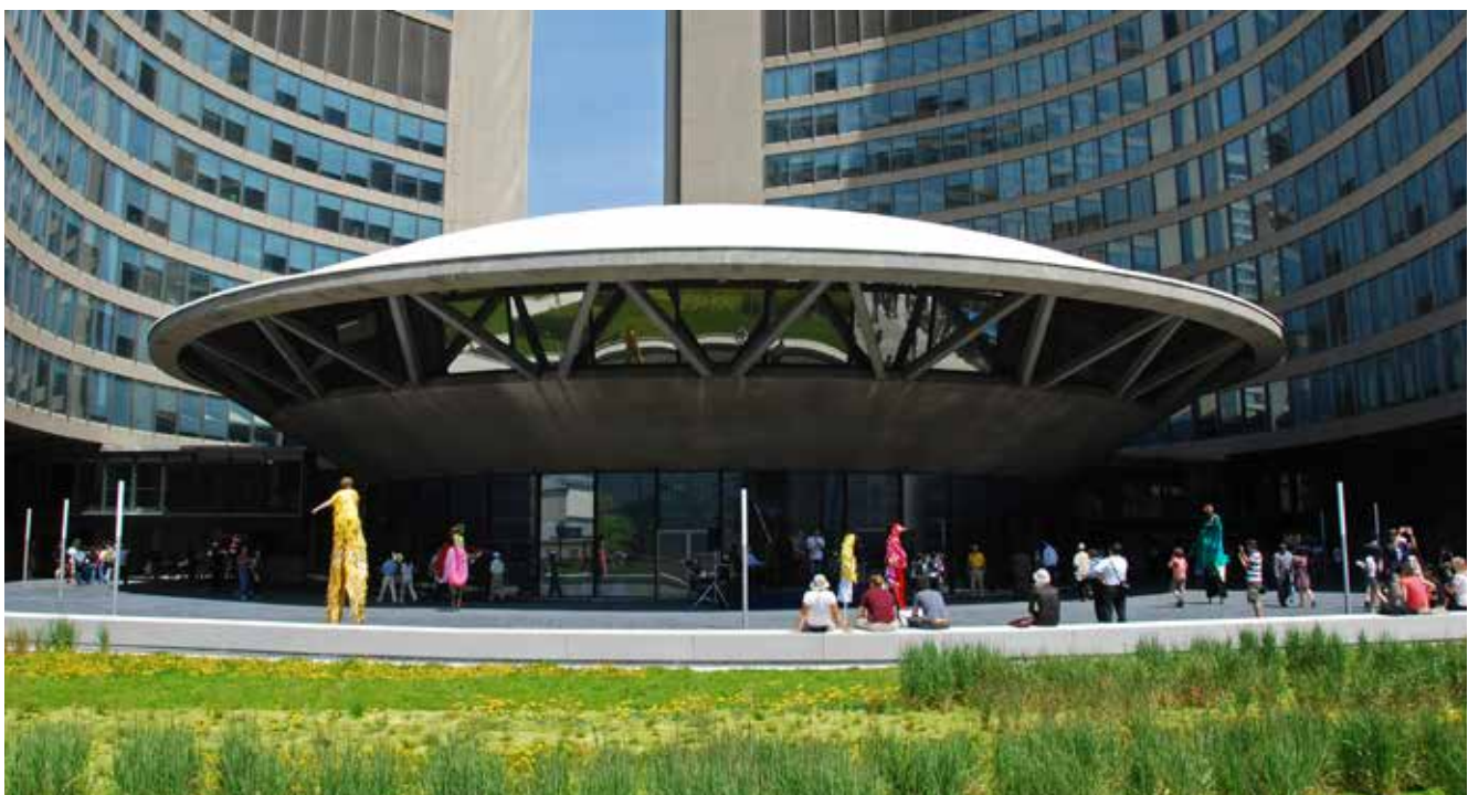
Toronto City Hall green roof.